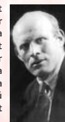
Seosamh Mac Grianna